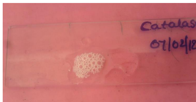
Figure3: Catalase Test for Staphylococcus sp.