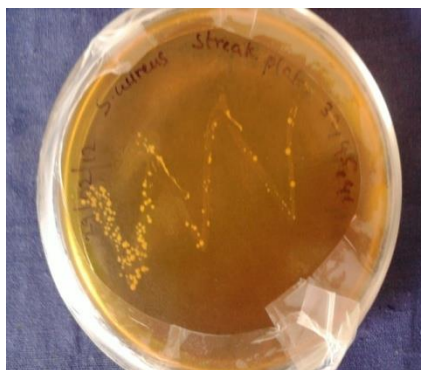
Figure 1: Streak Plate of Staphylococcus sp.

To further identify the organism, biochemical tests like catalase, coagulase, oxidase, indole production test, methyl red test, Voges-Proskauer test and mannitol tests were conducted. The results are represented in Table No.2, Figure No. 3 and 4. It was observed that catalase, coagulase, methyl red test, Voges-Proskauer test and mannitol tests are positive and oxidase, indole production test are negative for all the tested drinking water samples collected from Guntur, Krishna and Prakasam Dt., of A.P. Similarly, the bacterial contamination in drinking water samples collected from some rural habitats of northern Rajasthan, India [11] and the distribution of staphylococci and their resistance trends in different types of water was also assessed [6] . Tortora et al., [12] reported that in general Staphylococcus occurs in water that contains organic pollutants i.e., mineral ions, and organic matter contents. The organic matter content may provide a better environment for the development of this bacterium in water sources. The occurrence of this bacterium in drinking water samples may indicate the mixing of runoff water in water resources as suggested by Tortora et al., [12] . It is concluded that based on the morphological and biochemical characterization that the tested organism may be Staphylococcus aureus . However, further biochemical tests like DNase and haemolysis tests have to be conducted to confirm it.