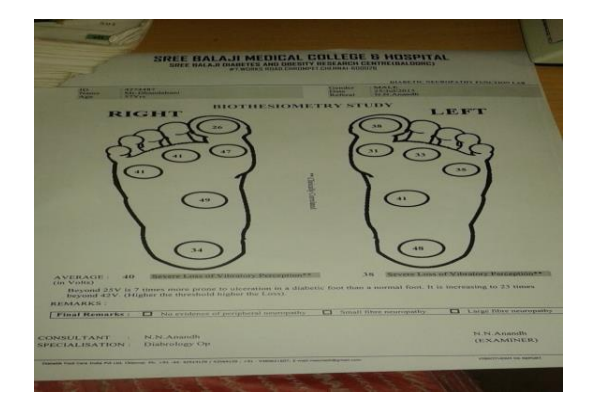
Figure 4: Evaluation report of VPT