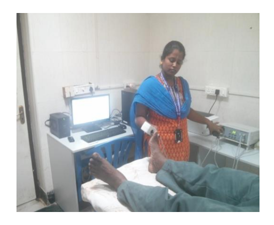
Figure 3: The VPT test done