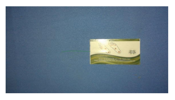
Figure 1: The Monofilament Used

Light touch/pressure perception was assessed using a 10 g monofilament. These were applied on both feet on the plantar surface of the hallux and centrally at the heel. The end of the filament was pressed on