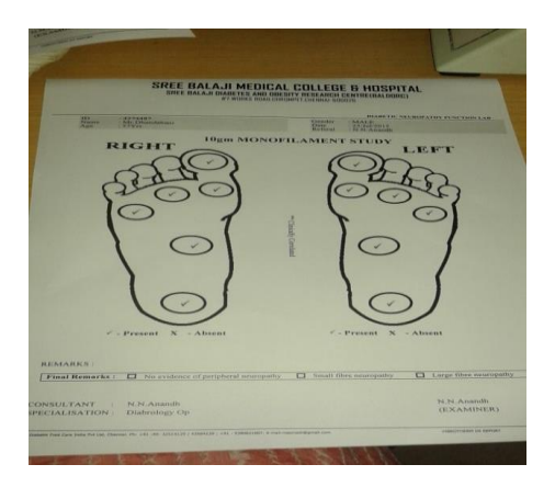
Figure 2: The evaluation sheet of monofilament test

the plantar surface of the hallux and centrally at the heel with enough pressure to cause the monofilament to buckle. This was done six times at each point and the participant was blinded to the application of the monofilament during testing [7]. A 'yes-no' method was used, meaning that the patient says yes each time he/she senses the application of a monofilament. The ability to correctly sense the monofilament in six trials on both locations was defined as normal, whereas the inability to sense the monofilament correctly in one or more trials was defined as disturbed.fig (1, 2)