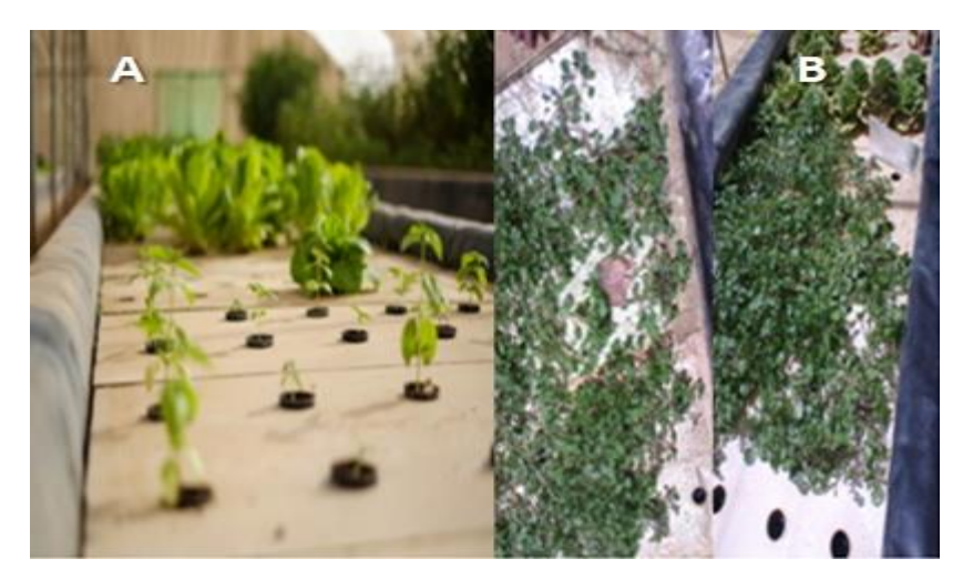
Figure 1: Experiment plots inside the greenhouse at "El-Bustan" farm. A: water tank covered with foams B: Watercress planted Hydroponically