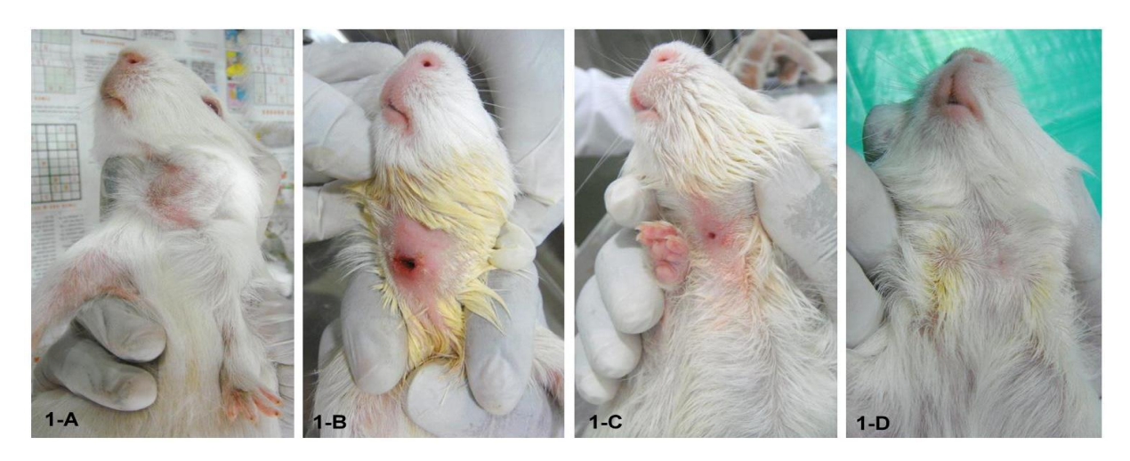
Figure 1A: Medium sized subcutaneous abscess on neck region Figure 1B: After surgical incision and drainage, the explored abscess cavity Figure 1C: Partially closed surgical wound Figure 1D: Complete closure of surgical wound