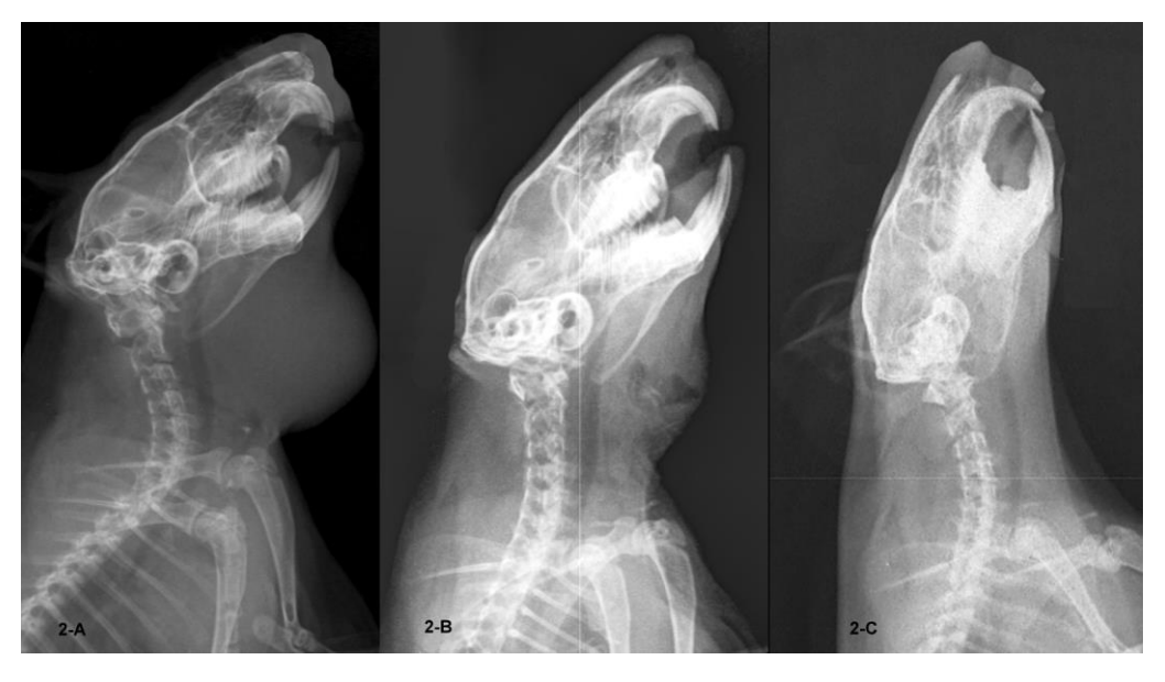
Figure 2A: The mass confined to the subcutaneous region of the neck. Figure 2B: Radiograph revealing residual purulent material in abscess cavity Figure 2C: Radiograph showing the complete recovery of abscess

In nutrient agar, the growth was characterized as shiny, golden yellow colored, opaque, large circular convexly elevated colonies. In blood agar, large colonies were surrounded by a wide zone of haemolysis with yellowish pigmentation. The colonies stained with Gram's stain was presented with, grape like clusters of gram positive cocci. In mannitol salt agar, the growths were typically appeared as yellow colonies with yellow zones. Biochemically the bacteria showed positivity for Catalase and Coagulase tests, negativity for oxidase test. From all the above results, the causative organism was confirmed as Staphylococcus aureus .