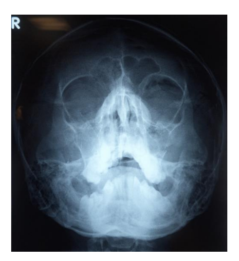
Figure 4: Preoperative X-ray of the patient