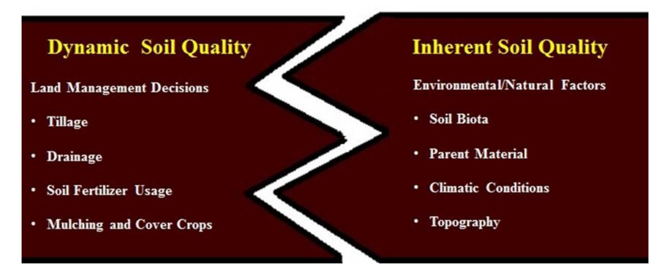
Figure 2: Various factors affecting dynamic and inherent soil quality

Soil health depends on both inherent and dynamic soil quality (fig 2) and former relies on group of different factors which may be natural soil characteristics like texture as result of soil formation, however later is affected by change in land use pattern and management practices and generally correlated with soil biological function. In addition the dynamic component is of most interest to farmers because good management allows the soil to come more productive in sustainable manner. The inherent and dynamic soil quality components do interact; however, as some soil types are much more susceptible to degradation and poor management than others.