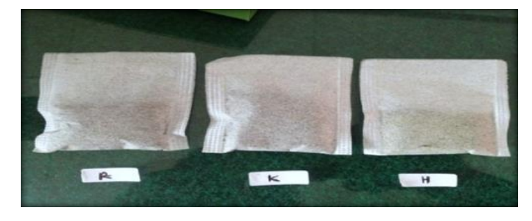
Figure 3: Herbal tea of mulberry leaves (A = chopped, K = grain powder, H = fine powder)