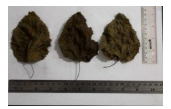
Figure 1: Herbal material of mulberry leaves

Microscopic evaluation of dried mulberry leaf was showed in Fig 2. The microscopic character of dried mulberry leaf meet the requirement of Materia Medika Indonesia [8].