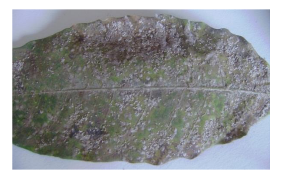
Figure 2: Sever infestation of mango leaf by condensed population of Aulacaspis tubercularis at the end of the season.