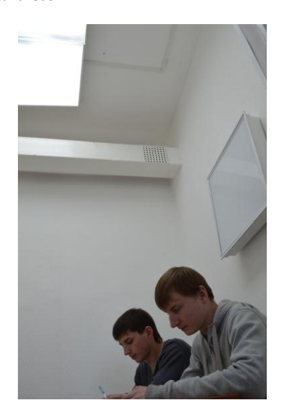
Figure 4: Visual performannce in room 2 and 3