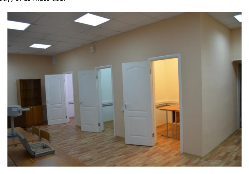
Figure 1: View of experimental research facility (photo)

Fluorescent lamps (FL) were chosen as a basic LS for comparison with LED LS were selected, because it is one of the most widely and deeply studied (iin terms of psychophysiological and hygienic influence of their radiation on the body) of LS mass use.