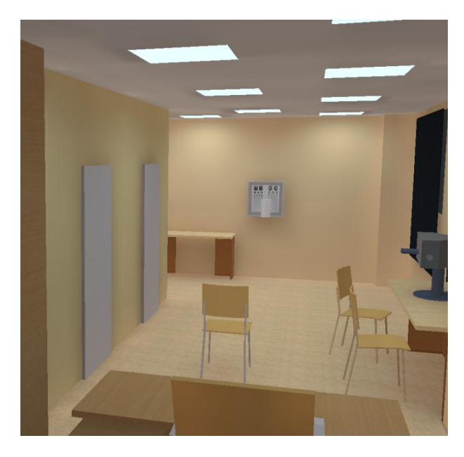
Figure 2: Premise for observer survey (model)