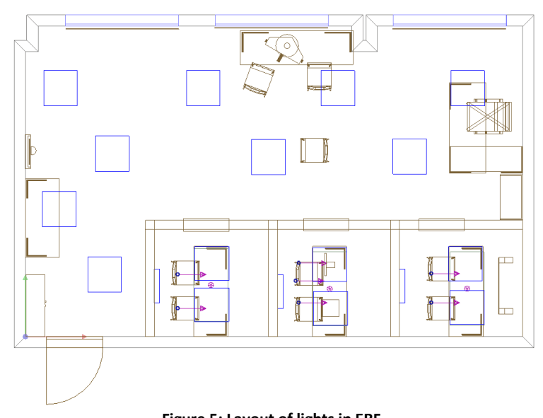
Figure 5: Layout of lights in ERF