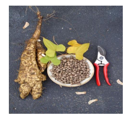
Figure 1: Parts of Dioscorea batatas plant including tubers, leaves and seeds.

March-April 2015 RJPBCS 6(2) Page No. 1014