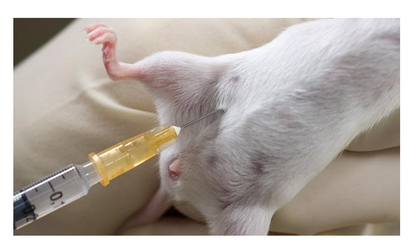
Figure 2: Drugs administered through intraperitoneal route.