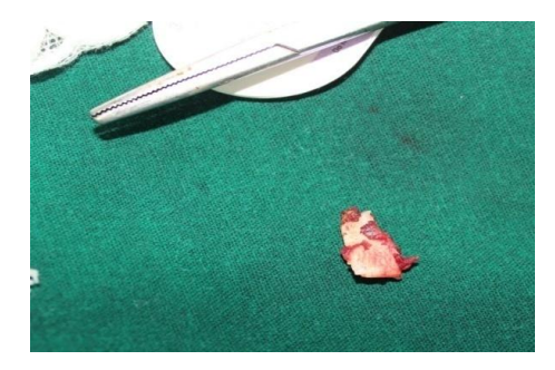
Figure 7: The coronoid process