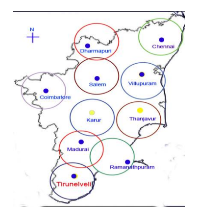
Figure 1: Map of Tamilnadu with 10 designated regions with separate teams of helicopters and a tertiary care centre

In order to immediately tide over the crisis of transport efficiency, helicopters could be bought by the government and it could be used for transporting the above mentioned categories of patients. Heliport with procurement of a helicopter for transport cadaveric organs for transplants, spinal injury, vascular injury victims. A heliport to be constructed preferably on the building to directly receive the transported patients or organs. Adequate number of helicopters needs to be purchased for this endeavor. Permission from the local aviation authority needs to be obtained. Enough aerial space must be made available for a helicopter to land at heliport and take-off at different angles in top of the referral hospital building. If there is a concern about safety separate heliport can be constructed in the adjacent area with facilities of landing at ground level and taking off from ground level.