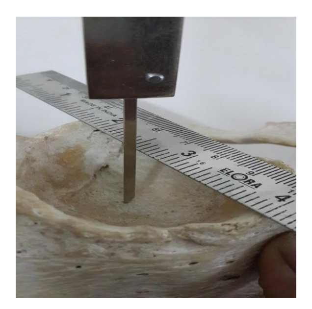
Figure 2: Measurement of Depth