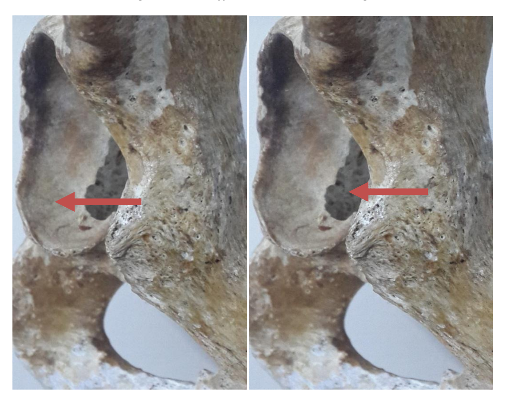
Figure 4: Angular type of anterior acetabular ridge