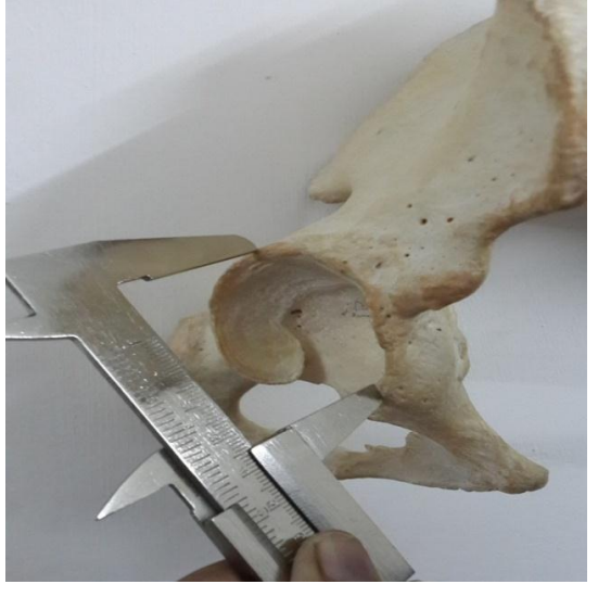
Figure 1: Shows the measurement of transverse diameter of acetabulum