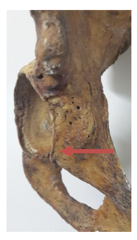
Figure 4: Curved type of anterior acetabular ridge

Regarding anterior acetabular shape morphology; majority was curved 60(60%) (Fig 3 ), 27 (27%) were angular (Fig 4 ), 9 (9%) were irregular (Fig 5 ), 4(4%) were straight (Fig 6 )