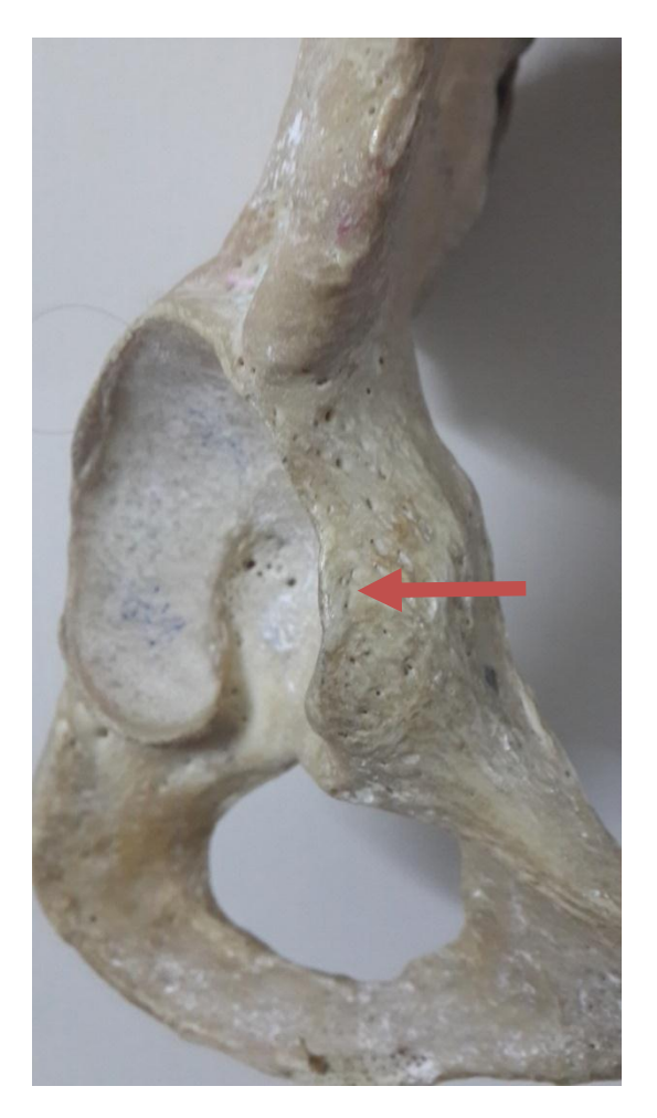
Figure 5: Irregular type of anterior acetabular ridge