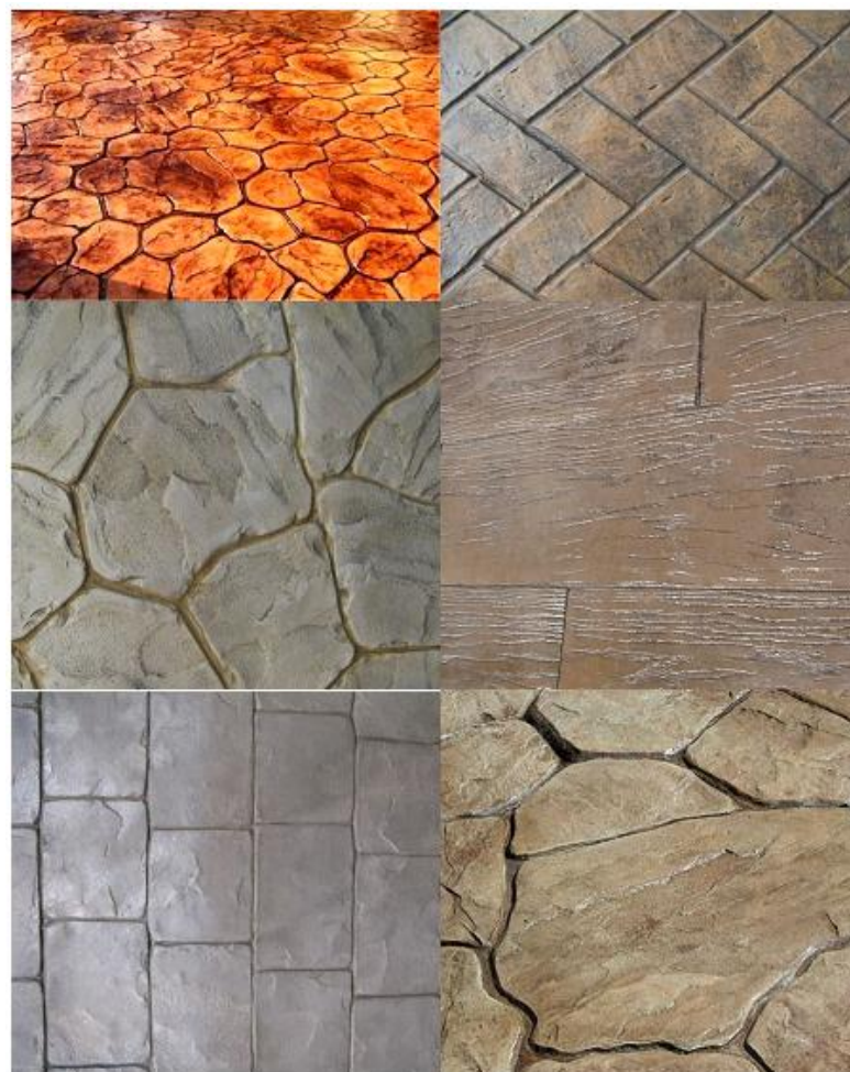
Figure 1: Obtained surface

Coatings made of high-strength (stamped) concrete look like brick, cobblestone or natural stone masonry, paving or even wood planks (fig.1). These coatings have a wide range of application: from garden paths and sidewalks, to making highways, town squares, alleys, floors in show-rooms, halls, restaurants and in living accommodations (fig. 2) [11]. A large variety of forms, textures and colors makes it possible to create unique surfaces and match them with architectural style while providing the high technological and building performance: strength 60-100 MPa, improved wear-resistance, frost-resistance and rust resistance [12]. Along with work, aimed at obtaining the optimal formulas of high-strength ornamental concretes, we carry out the research of processing technologies of depositing them on the prepared base. In practice, depositing of stamped (fig. 3) concrete is done in several stages, which include preparatory and finishing works.