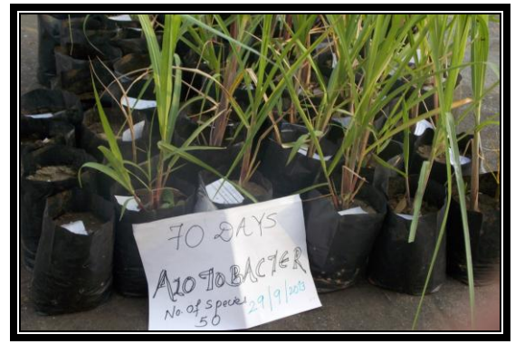
Figure 2 Azotobacter treated set