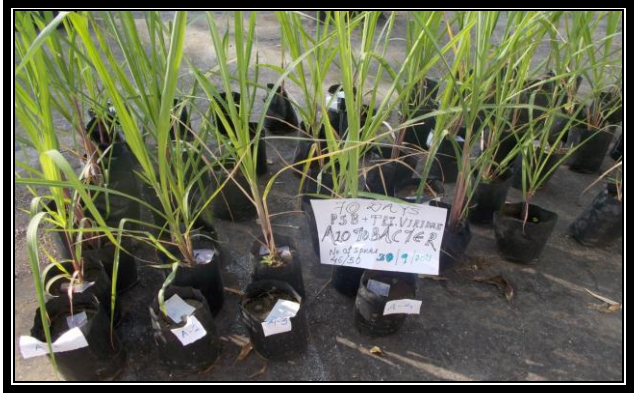
Figure 4 Trichoderma viridae + Azotobacter + PSB treated set

The germination percentage depicts the increased growth rate (Table.1). Tri. Viridae , Azotobacter , Phosphobacter individually showed decreased rate of growth compared to the applied combination of the biopesticides.