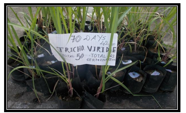
Figure 1 Trichoderma viridae treated set

The germination patterns for the biopesticides have been depicted below Figures, 1, 2, 3 and 4. The growth was higher and compared to the individual separate biopesticides.