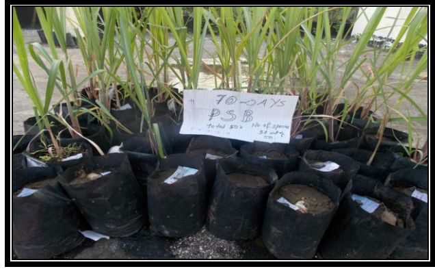
Figure 3 Phosphate Solubilizing Bacteria