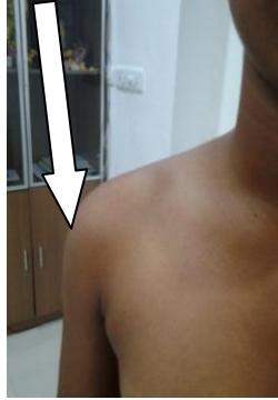
Figure 2. A closer view of the patient with swelling seen at the lateral end of the right clavicle.(marked by arrow)