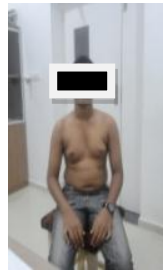
Figure 6. Patient sitting after 2 year of surgery.