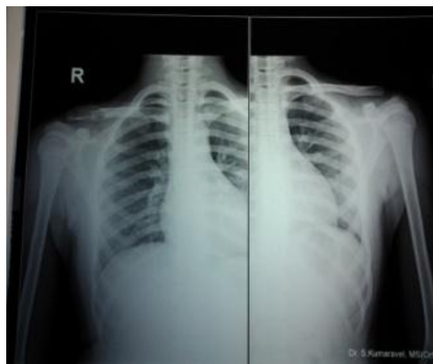
Figure 3. Radiograph showing a lesion involving the lateral aspect of the right clavicle with expansion of the cortex. The unaffected left clavicle is also shown for comparison.