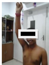
Figure 10. Patient doing flexion of the right (operated side) shoulder comfortably after two years of surgery.