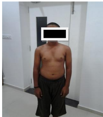
Figure .1 Preoperative clinical photograph showing the swelling in the right clavicular region in its lateral half.

Figure 3. An MRI scan showed an expansible lesion filled with blood. In some sections there was thickening outer end of clavicle to an extent that could be easily mistaken for an acromion. (Figure 4). An FNAC was done but it turned to be inconclusive. Patient was put on anti epileptic medication and assessed for surgery. At operation, the lateral 1/3 rd of clavicle along with the tumor in toto was excised with adjacent normal bone. The excised specimen was similar in appearance to an acromion. Histopathological examination confirmed our diagnosis as Aneurysmal bone cyst. A cut section revealed the blood filled cavity. Figure 5. Two years after the surgery, the boy had no complaints; he had complete healing of the operated wound with a non tender, smooth, healed scar. (figures 6 and 7) He was able to do all range of movements of his right shoulder (figures 8-10). There was no evidence of a clinical or radiological recurrence. (Figure 11).