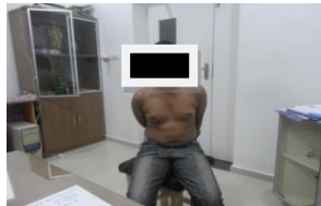
Figure 8. Patient doing extension of both shoulders comfortably after two years of surgery.