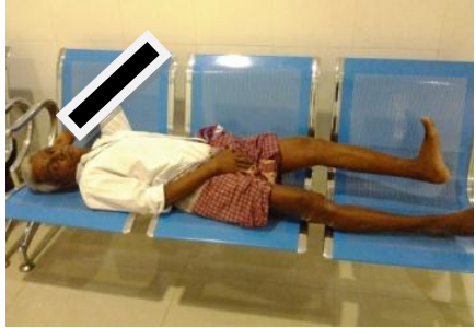
Figure 8. The patient is seen raising a straight leg at 4 months follow up. Figure 7.

Figure7. The second patient's X-rays at 4 months follow up showing the amount of callus and union.