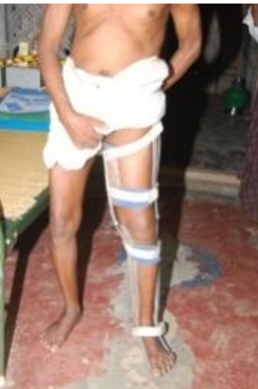
Figure 5. Patient 2 pathological fracture of the Pagetic femur seen standing with his orthosis on.

Figure 4. CT section of the affected side head of the pathological Pagetic femur which fractured in its lower third. the disorder in architecture is seen