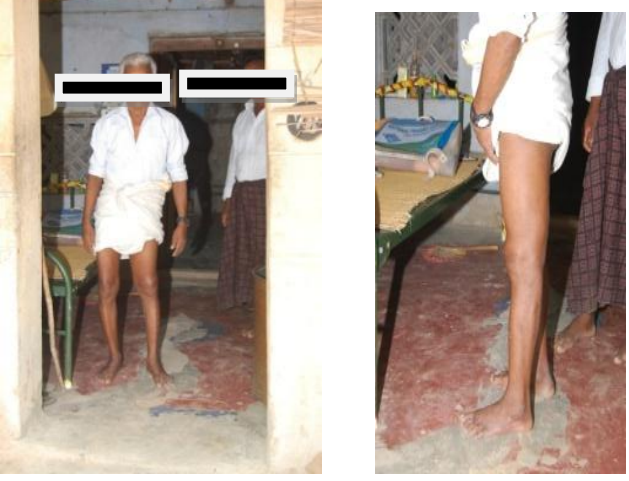
Figure 9 Figure 10 Figure 9 and 10 shows the ability of the patient to walk without support at 5 months however, with residual shortening of his left lower limb to be managed with a heel and sole raise.

Figure 8. The patient is seen raising a straight leg at 4 months follow up. Figure 7.