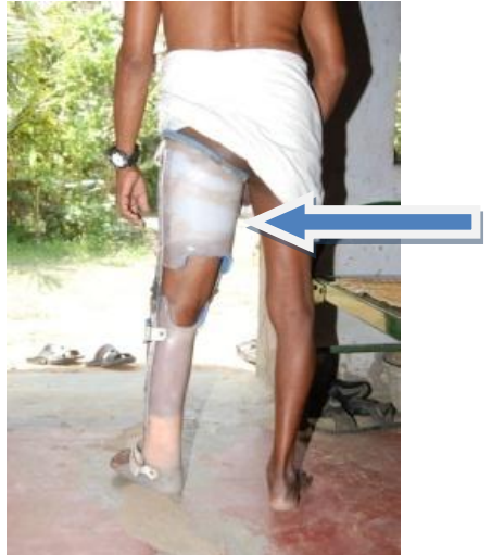
Figure 6. The exact site of weight relief at the ischial tuberosity is seen from behind. An arrow is seen pointing his area of weight relief.

Figure 5. Patient 2 pathological fracture of the Pagetic femur seen standing with his orthosis on.