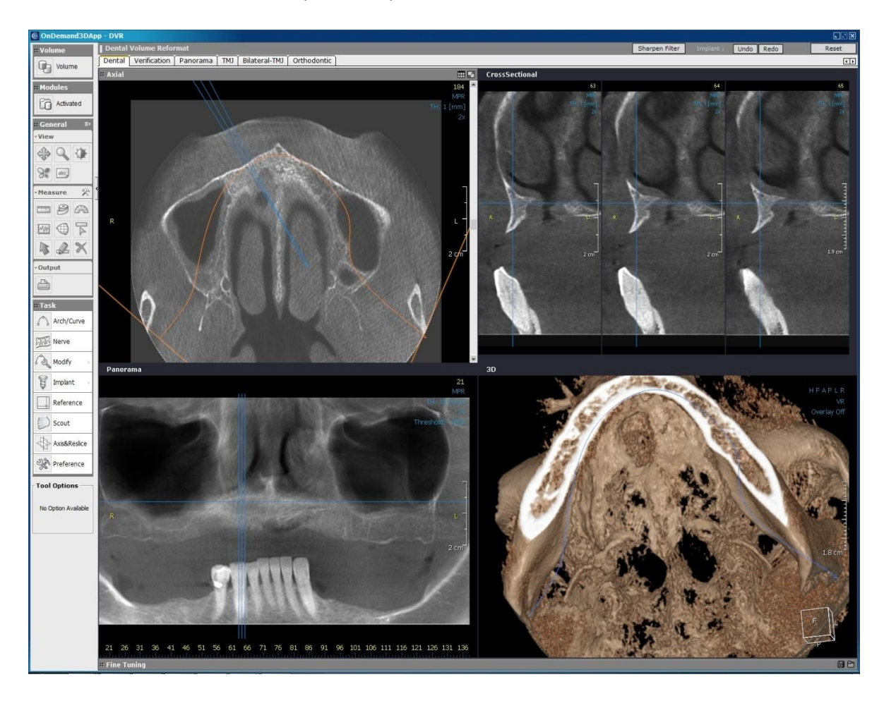
Picture 1. CBCT after the extraction of remnant tooth tip and presence of oronasal communication.

which promoted healing. It took five months for oronasal fistula to heal and this was also consequence of patients immunosupressive therapy, albeit without additional surgical intervention for fistula closure (Picture 2).