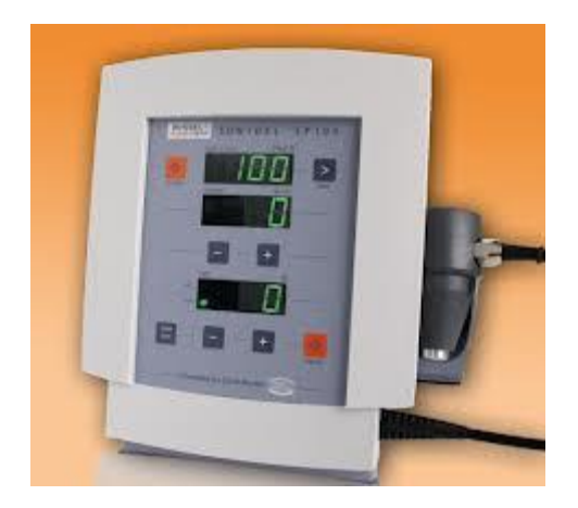
Figure 2: Sonoporator