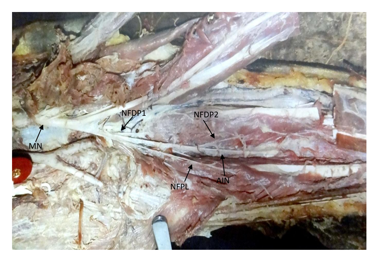
Fig. 1 showing AIN arising from MN distal to IEL and giving 2 branches to FDP and 1 branch to FPL.

n-Number of specimens, NFPL-nerve to Flexor pollicis longus, NFDP-nerve to Flexor digitorum profundus.