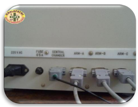
FIGURE 3 & FIGURE 4