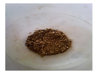
Conventional extraction Product 3