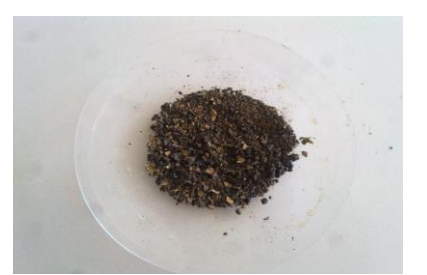
MAE 2 Product