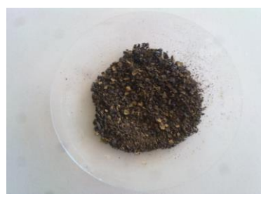
MAE 3 Product

The marc was re-extracted with varying amounts of 70% methanol for different time intervals and varied power of Microwave thrice, filtered and the methanolic extracts combined. The methanolic extracts were concentrated to 1/8th volume, acidified to pH 3.2 by adding HNO<sub>3</sub> with constant stirring. The mixtures were set aside at different time intervals in all the three cases at 5°C, filtered and 1g of anhydrous calcium chloride in 12ml of denatured spirit was added with constant stirring. The pH of the solution was adjusted to 8 by addition of potassium hydroxide (KOH) and was set aside at different time intervals in all the three procedures. The precipitate obtained in all the three cases were collected, dried and weighed. The percentage yield was also calculated.