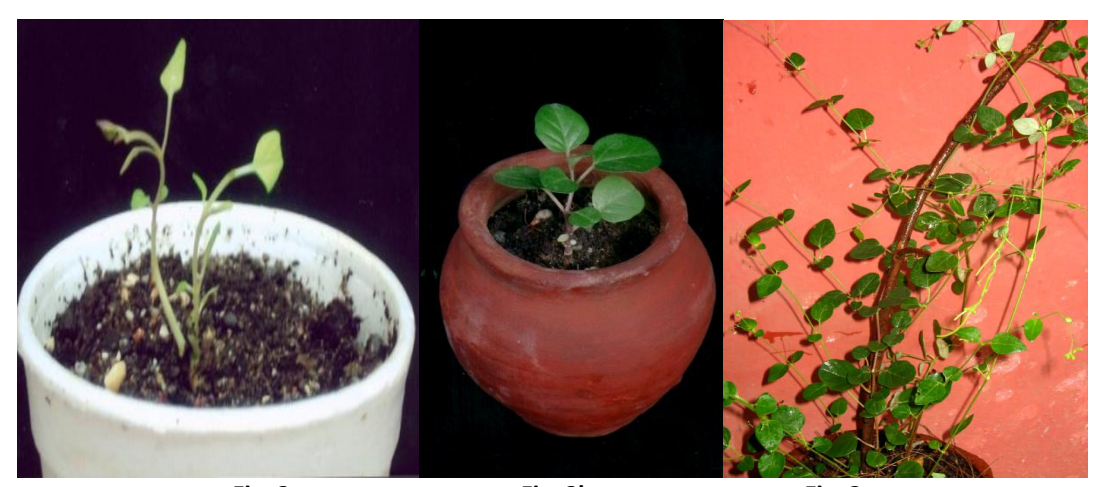
Fig. 2aFig. 2bFig. 2cLegends to the figure 2-Acclimatization of in vitro regenerated plantsFig.2a- Hardened plantlets transferred to green house.Fig-2b- Plantlets acclimatized under green house conditions.Fig.2c- Plant growing under ex vitro conditions after 6 months of transfer.

85% of the plants survived during hardening procedure [Fig 2a] and were transferred to green house in small earthen pots. These were kept at the green house for 3 weeks [Fig. 2b] and then were transplanted to field where they are showing health growth under ex vitro condition [Fig 2c].