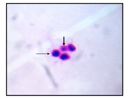
Figure 2: Photomicrograph showing the ingested viable candida phagocyte (→→) in three phagocytes and ingested dead candida (→→) in one phagocyte [evidence of intracellular killing in peripheral smear) 100 x]

Table 2 shows intracellular killing of candidial species by neutrophils in the study group and controls (Figure 2). 93.3% of the oral squamous cell carcinoma cases had suppressed / mild grades (less than 30%) of intracellular killing whereas 6.7% of cases belonging to the same study group demonstrated moderate grades (30-60%) of intracellular killing activity. The control group who were smokers showed moderate grades( 30 -60%) of intracellular killing.80% of the control group who were known smokers showed high grades (100%) of intracellular killing activity, which was statistically significant (p < 0.05).