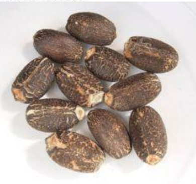
Figure 6: Seeds