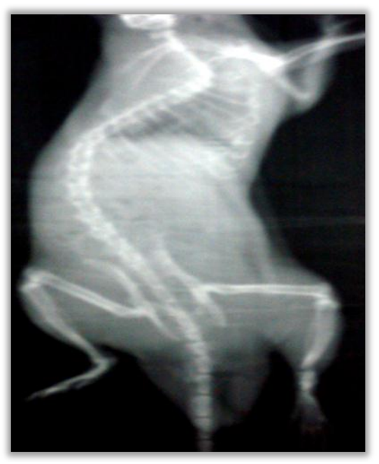
Terminalia arjuna Treated