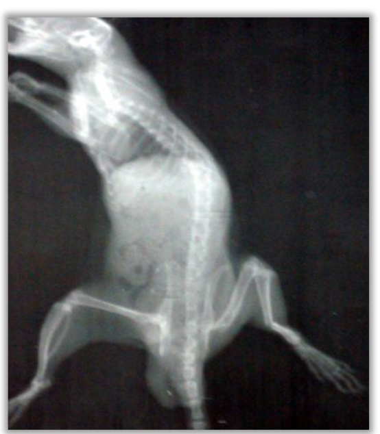
Terminalia arjuna Treated