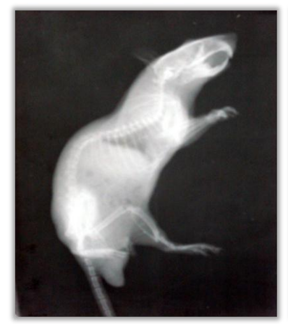
Normal saline Treated