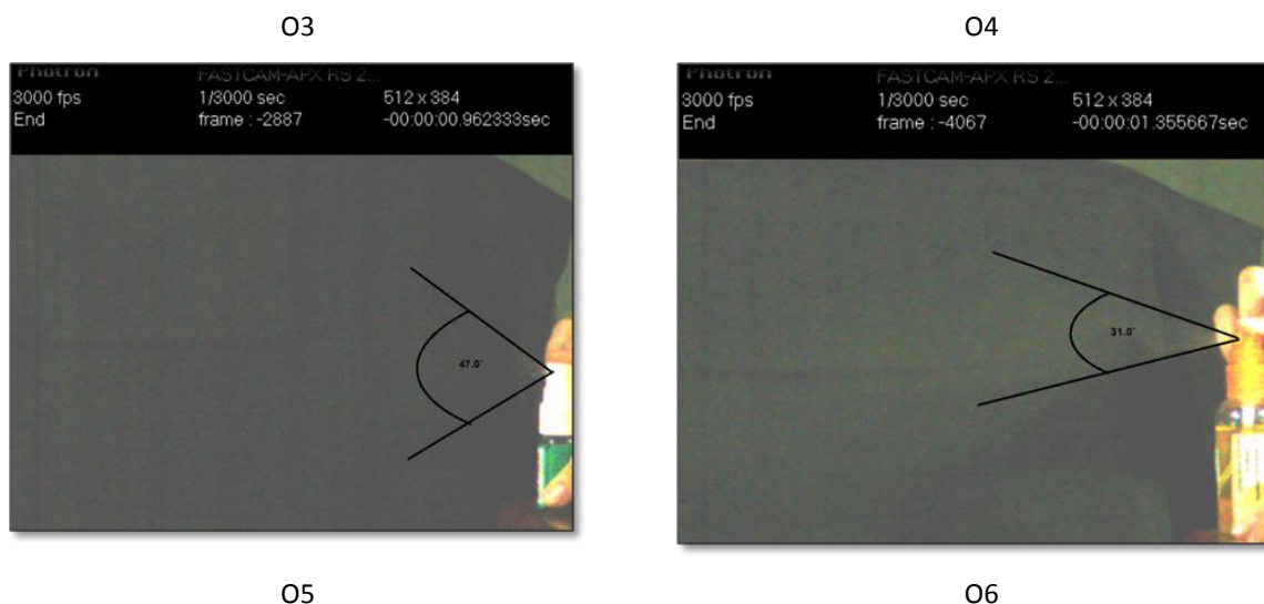
Fig. 1 Spray pattern exhibiting the spray angle of different oral sprays obtained from high speed camera.