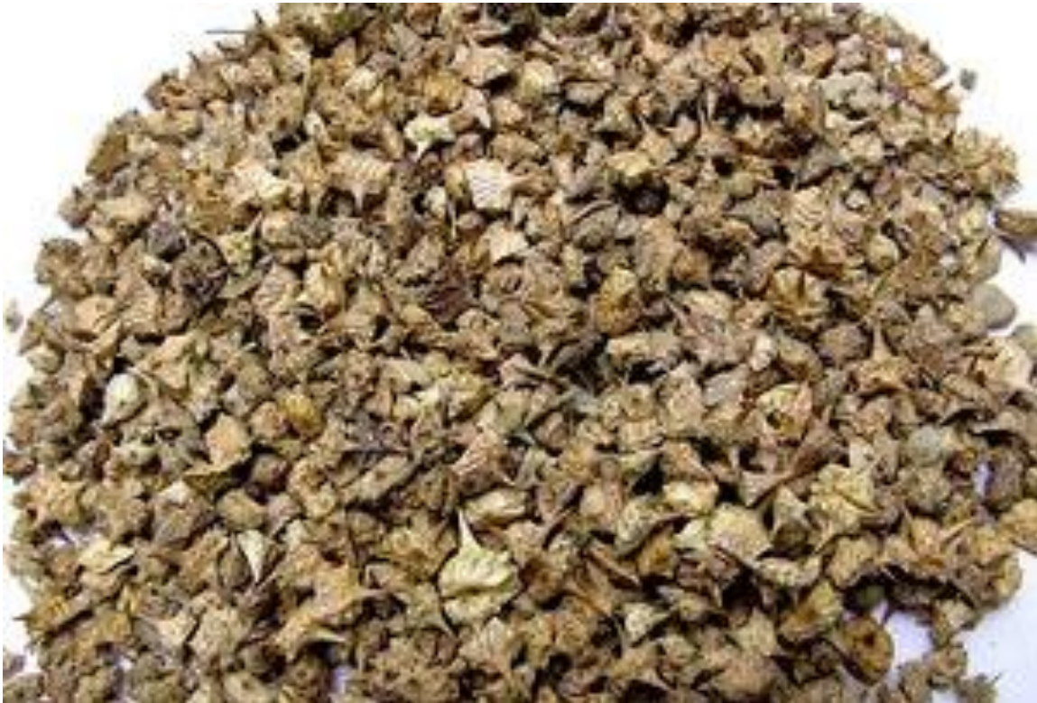
Tribulus terrestris (4" *6")