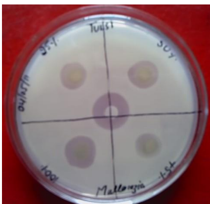
Figure I Effect of water extract of Tulsi on M.furfur

Minimum Inhibitory Concentration (MIC) value of 5 mg/ml was obtained with Oscimum sanctum .