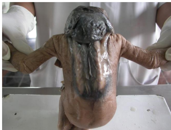
Fig.2 Showing Split Spinal Cord And Spinal Nerves In Malformed Vertebral Column

A still born female foetus with sacral meningocele is delivered by a female of 32 years at 34 wks of gestation. The foetus presented a sacral meningocele containing fluid filled cyst without the involvement of spinal cord.( fig.3)