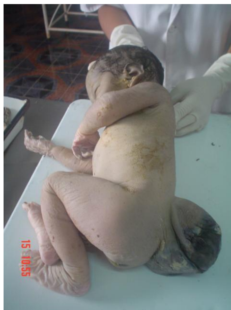
Fig.3 Showing Sacral Meningocele

A still born female foetus with sacral meningocele is delivered by a female of 32 years at 34 wks of gestation. The foetus presented a sacral meningocele containing fluid filled cyst without the involvement of spinal cord.( fig.3)